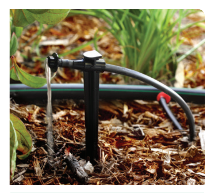
Xeri-Bug<sup>™</sup> Emitter, TS025-1/4" stake, and DBC025 Diffuser Bug Cap